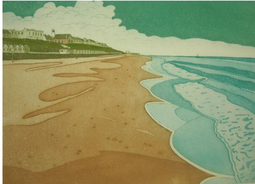
Southwold, Suffolk Etching with Aquatint 1981